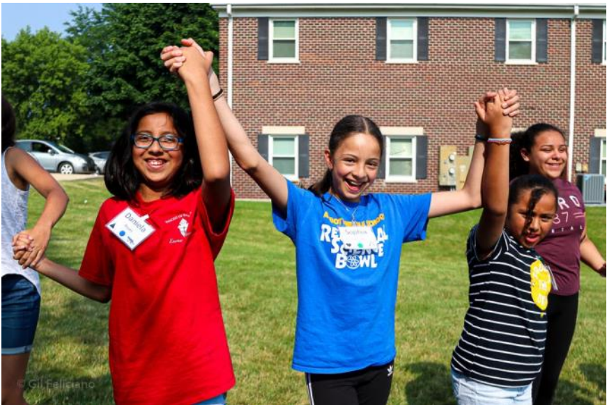
LEAD summer program students

Serving the suburban Chicago areas of Kane and Cook Counties with offices in Elgin, St. Charles, and Streamwood.