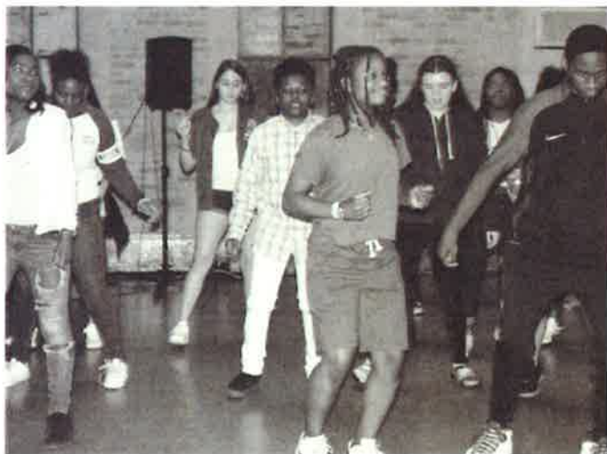
Teens dance the night away at a CSHE sponsored event.